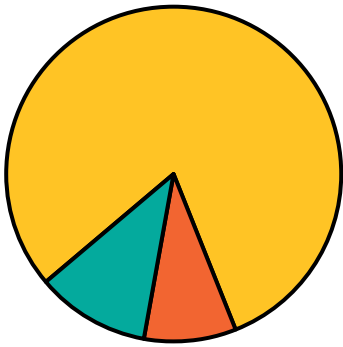
USES OF FUNDS FISCAL YEAR 2010