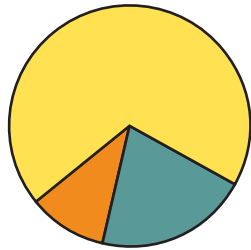
USES OF FUNDS FISCAL YEAR 2008