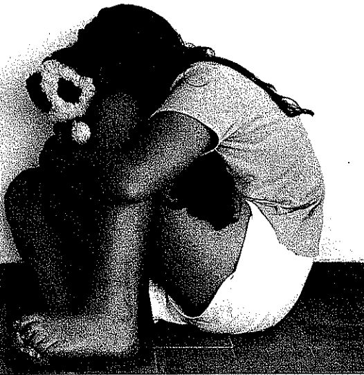
Intimate partner sexual assault is associated with more severe depression, anxiety, and behavior problems in the children of adult victims.